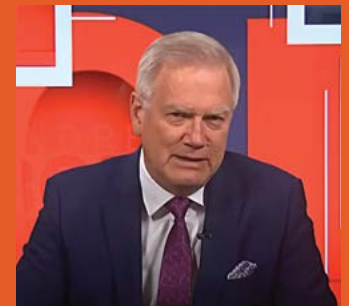
Andrew Bolt on Sky News

Last night I watched Andrew Bolt on Sky News Australia. That's the equivalent of Fox News in America. Both Fox and Sky are owned by the powerful Murdoch family from Down Under. Andrew seemed depressed; he looked and sounded depressed because he doesn't like the direction the world is heading. Like most Australians he is not a Christian but is a good man who respects Christian values. He was interviewing a clever philosopher who told us why we should be cheery and optimistic. He was like the man watching a house on fire and who tells the occupants to be happy and enjoy the fireworks.